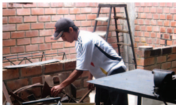
At the Reque Friends of Peru Metalwork Shop

together towards this goal. They built their self-confidence and learnt how to select and market their products and how to manage a business. Throughout the 8-month period they met for 3 hours twice a week to create product inventories and improve their sewing and knitting skills. This time together was an important source of friendship and mutual support. At the end of the project, fifteen of the women committed to forming the micro-enterprise. The others will continue to sell their products individually. Obtaining legal status for the micro-enterprise and additional business management and marketing training are planned for 2008.