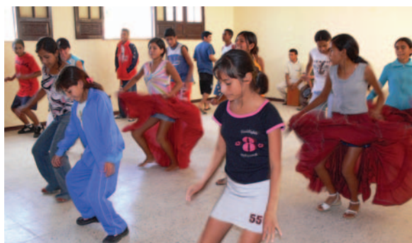
Some of the participants in the three adolescent groups share their dancing skills

At the urging of the mothers in these 3 small rural communities a new program was introduced for the adolescents of the three comedores . In cooperation with Centro Esperanza, a year-long project began whereby 8 UNEC ( Union Nacional de Estudiantes Católicos ) university students from Chiclayo volunteered to meet weekly with the adolescents to give them the opportunity to communicate with each other and develop their self-confidence and leadership skills. Every 6 weeks the separate groups from the 3 comedor communities were brought together to share their achievements. Thirty-five adolescents participated regularly all year. The goal is that they will ultimately form and lead their own permanent adolescent groups.