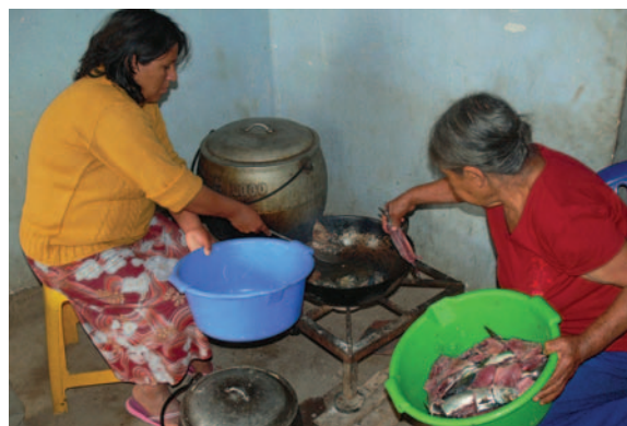
Preparing a nutritious meal at the Mocupe comedor

create and cook balanced menus. The executives of the three comedores met together once a month as a Coordinating Committee ("CoCo") to evaluate progress, distribute tasks and share experiences and problems. During 2007 also the mothers reviewed and revised the "rules" of their comedores . They even found time to have workshops on topics such as Free Expression, Breastfeeding, and Family Relationships and, during the summer holidays in February, to take their children to have fun at the seaside.